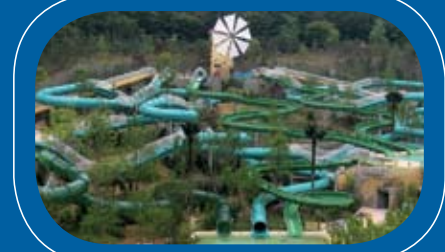
Everland's Caribbean Bay, Korea