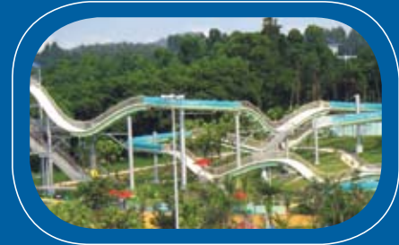
Chime Long Waterpark, China