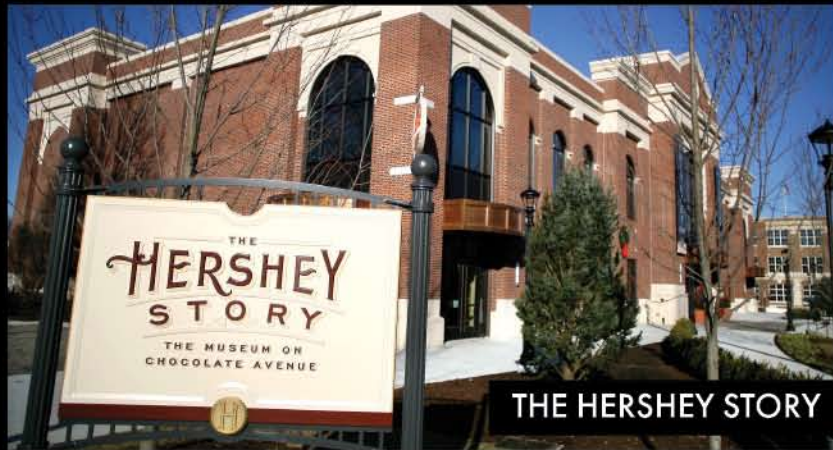
THE HERSEY STORY