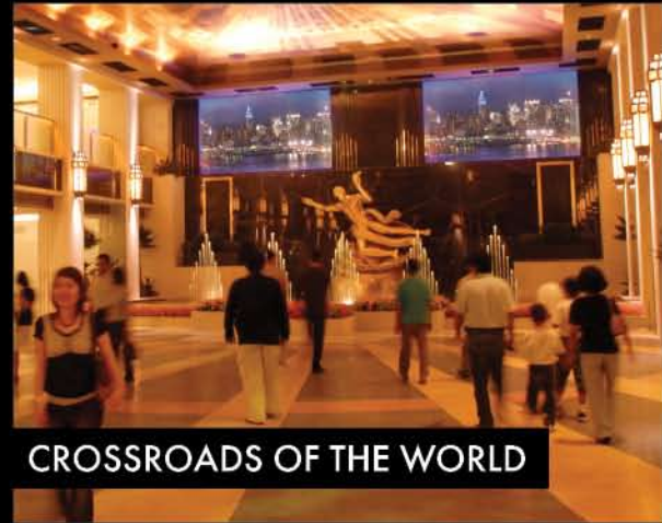
CROSSROADS OF THE WORLD