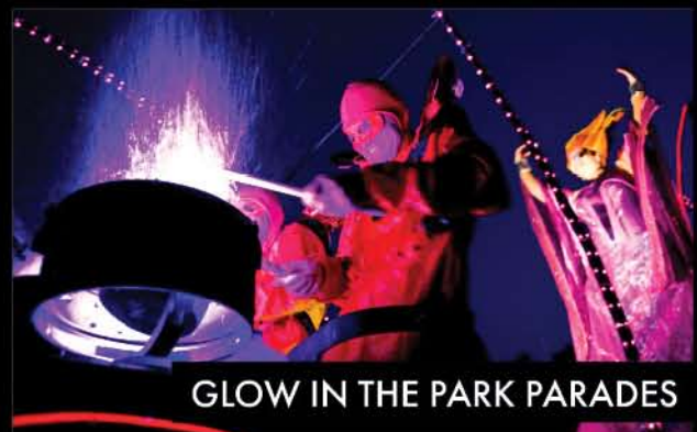
GLOW IN THE PARK PARADES