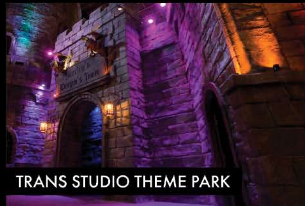
TRANS STUDIO THEME PARK