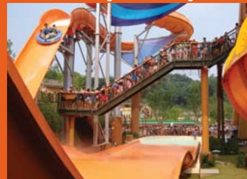
Caribbean Bay, Korea

Combination of 4 sensations in 1 attraction!