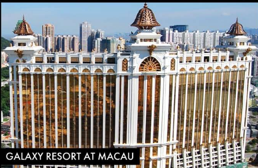
GALAXY RESORT AT MACAU