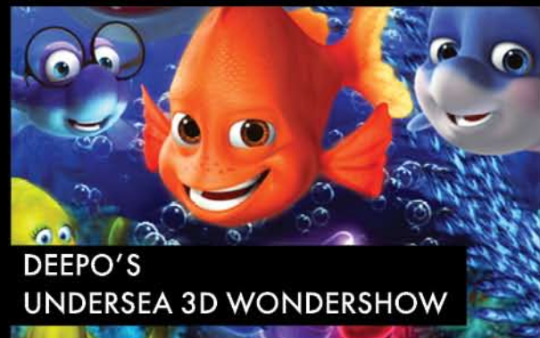
DEEPO'S UNDERSEA 3D WONDERSHOW