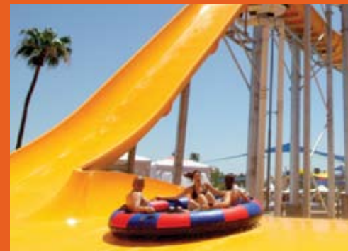
Wet 'n' Wild, Arizona