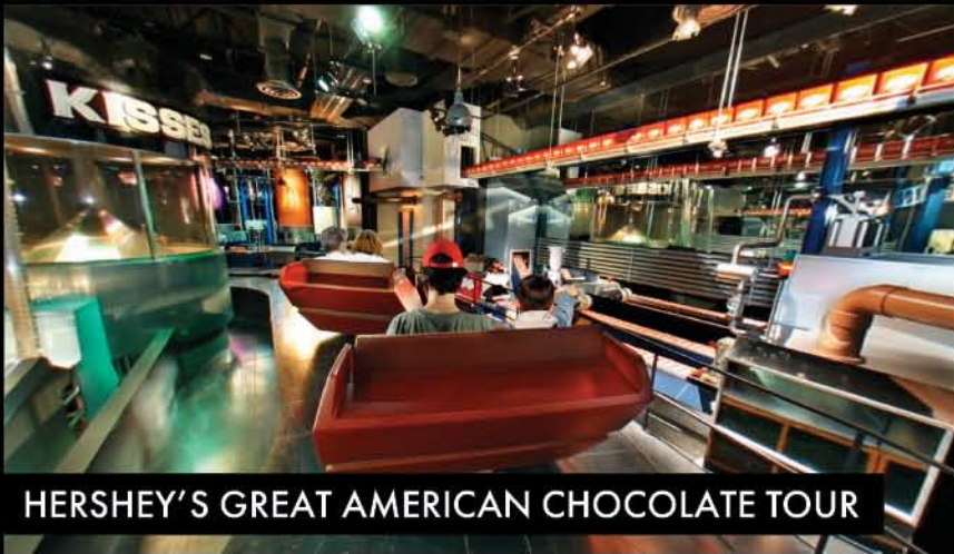
HERSHEY'S GREAT AMERICAN CHOCOLATE TOUR