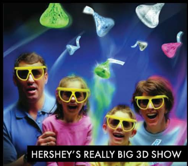
HERSEY'S REALLY BIG 3D SHOW

Contents © 2009 Gary Goddard Entertainment except as otherwise noted. Hershey's Really Big 3D Show © 2002 Hershey's Chocolate World, Hershey's Times Square © 2002 Hershey's Chocolate World, Hershey's Great American Chocolate Tour © 2006 Hershey's Great American Chocolate Tour © 2006 Hershey's Chocolate World, Crossroads of The World © 2007 Grand Indonesian, Glow in The Park © 2008 Six Flags Corp, Magic Light Parade © 2008 Six Flags Corp, Grammy Museum © 2008 NARFAS, Monster Mansion © 2009 Six Flags Corp, Galaxy Resort at Macau © 2009 Galaxy Entertainment Group Ltd.