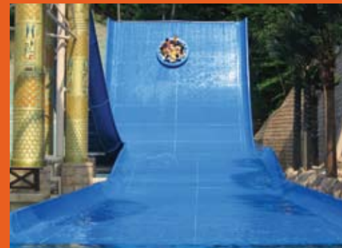
Ocean World, Korea