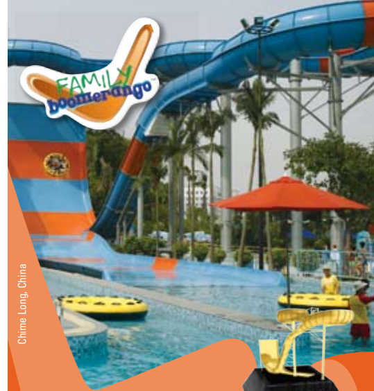
Chime Long, China