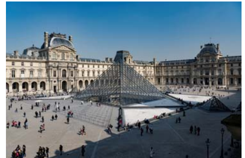
The Louvre Pyramid

The Louvre will reopen on Monday July 6 after almost four months of closure. To ensure safe conditions, visitors will be required to book a time slot to visit the museum. All those entering the palace will be also required to wear a mask and follow social distancing and hygiene recommendations.