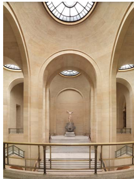
The Winged Victory of Samothrace

The Musée du Louvre has extended most of the 520 short-term loan contracts made prior to lockdown. The majority of the loans are on