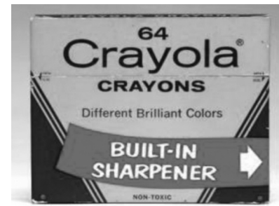
Figure 3 The Crayola 64-count box with a built-in sharpener

Fulfilling as the first 70 years were, the ensuing 30 were fraught with many