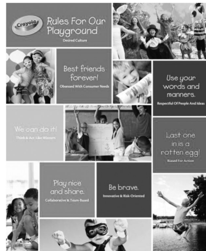
Figure 5 Company culture statements before and after