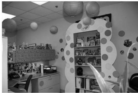
Figure 6 A workspace transformed