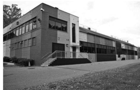
Figure 8 The physical environment before and after

with parents and educators in raising inspired, creative children. The aim is to help parents achieve their inspiration to raise balanced, well-rounded children and help them develop a strong sense of self through expressing their original thoughts and ideas. It is intended to help offer insights, support and solutions and elevate the conversation to this higher level.