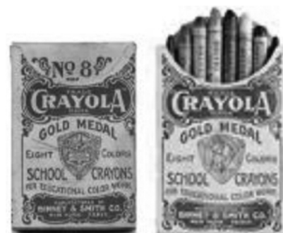
Figure 2 The first box of eight Crayola wax crayons

In 1903, Edwin was once again inspired to action by Alice’s work in the classroom. While slate pencils were a valuable school tool, the Binney & Smith partnership was originally founded on colour . And so, recognising the need for safe, quality, wax crayons for children, Binney & Smith produced the first box of eight Crayola 1 crayons (Figure 2). But the genius was not in the invention of the tool itself. After all, pigmented wax and