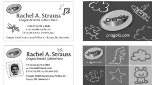
Figure 7 New company ID and business card